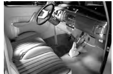
[ auto interior ]