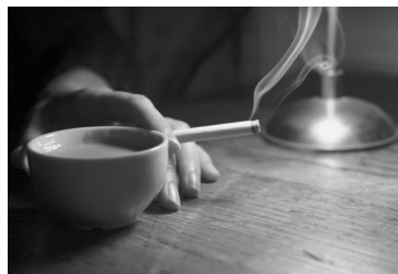
[ smoke ]