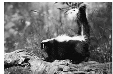
[ severe odors ]